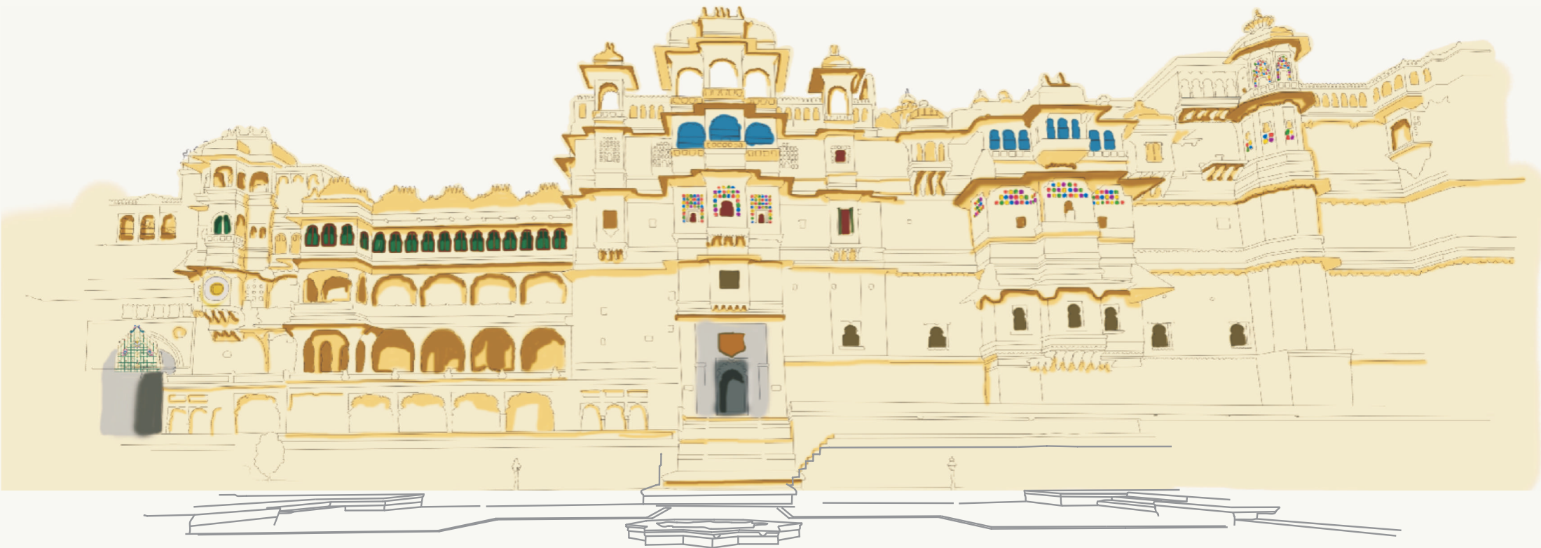
The City Palace Museum, Udaipur